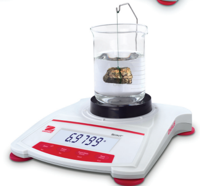
Scout shown with optional Density Determination Kit

It's all about accuracy and efficiency with the OHAUS Scout balance. Stabilization time as fast as 1 second combined with high resolution deliver extremely precise and repeatable weighing results that you can count on time and time again. This makes the Scout ideal for routine experiments and other weighing applications in your classroom.